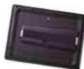
Protection Cover MC-408

Hand Strap is available for added security