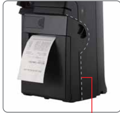
Detachable Receipt Printer (HS-3500 & HS-6500 Series)

Detachable modular printer design allows quick access to the components, providing convenient and efficient serviceability.