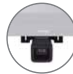
Optional 2D Barcode Scanner