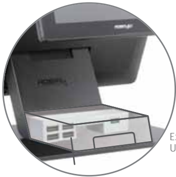
Expandable USB Module