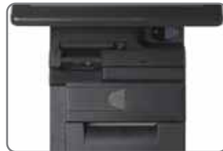
Optional Built-in MSR Fingerprint Sensor and RFID Reader