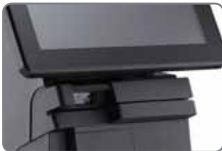
Optional Built-in 2D Barcode Scanner (HS-3500 & HS-6500 Series)

Peripheral options come with MSR, fingerprint sensor, RFID reader, barcode scanner and thermal printer, are ideal for daily POS operation.