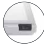
Optional Built-in 2D Barcode Scanner