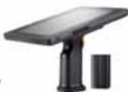
Pistol Grip PG-201E

Pistol Grip shaped handheld with 5000 mAh battery built-in and optional 1D or 2D barcode scanner for Retail Package (R)