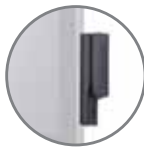
Optional 3 in 1 Module of MSR, RFID and Fingerprint Reader